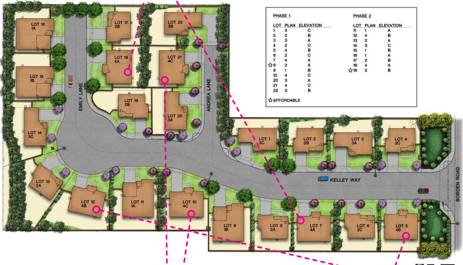
PLAN 4C Lot #21 & #10